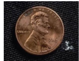
Fatal dose of fentanyl.

The lethal potency of fentanyl and its easy availability increases the already risky behavior of recreational drug use. There is no such thing as a safe street drug, and it is dangerous to misuse prescription drugs. Be aware. Be informed. Be safe. Learn more about opioid use, where to get help, and the Fentanyl is Forever awareness campaign at www.SJCopioidsafety.org .